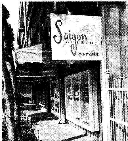
Delicious vegetarian meals are available at Saigon Cuisine. VSH Members receive a 70% discount with membership card.

The restaurant's unassuming exterior gave way to a peaceful dining area whose beauty unfolded as we relaxed. Tables were spaced far enough apart for comfortable and intimate dining. Soft music played as we admired the pastel murals of Vietnam that covered the walls, and the tasteful furnishings of bamboo, wood, and black lacquer spoke of an attention to detail we hoped would extend to the food preparation. The menu did not have a separate vegetarian page, but there were many vegetable and tofu selections from which to choose, and brown rice was available. We ordered tofu rolls as an appetizer. Our waiter understood immediately when we requested no fish sauce; he suggested an egg-free vegetarian crepe