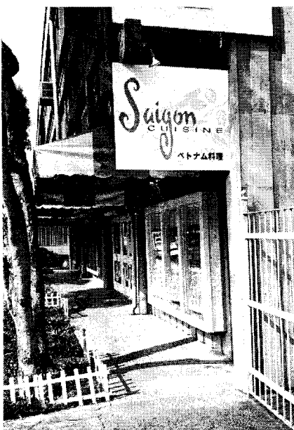
Inside, Elaine French reviews her dining experience at Saigon Cuisine. Turn to page 3 for the full scoop.