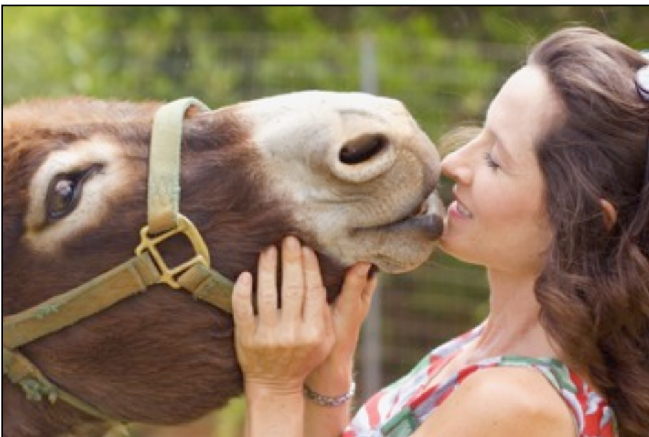
At Leilani Farm Sanctuary the love flows both ways.

There are some who believe that human beings rightly have exclusive dominion over all the animals, which are to be used to satisfy human whims. Others, however, view the human role as one of responsible stewardship and cooperative living in harmony with all life on earth. LFS exists as a living testament to the birthright of every sentient being to have a quality life of gentle companionship, in safe community with others.