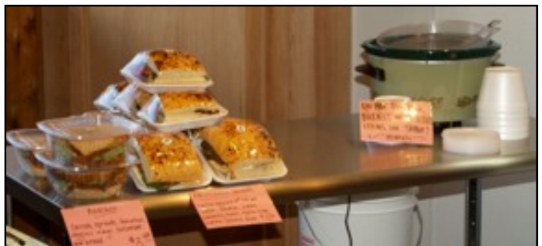
The soup and sandwich bar at Huckleberry Farms boasts a variety of quick vegan snacks and meals.

Both Huckleberry Farms and Down to Earth have long been supporters of the Vegetarian Society. In addition to giving discounts to our members, Down to Earth has been generously donating vegan refreshments for VSH monthly lectures on Oahu.