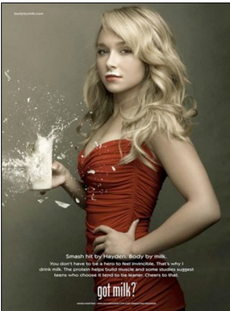
This milk ad aimed at teens is part of a deceptive campaign that suggests drinking milk can help you lose weight.