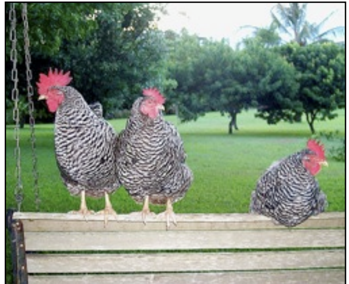
Henny, Penny, and Jenny enjoy their perch on a swing at Leilani Farm Sanctuary.

LFS is in need of volunteer help. Tasks include barn cleaning, brushing the animals, and trimming the goats’ hooves. Fundraising and graphic de-