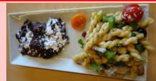
1st Place: Chocolate Brownie Cookie and Pasta Salad, prepared by a team of three 10th graders.