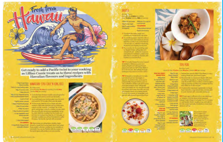
2-page article with recipes from Hawai'i A Vegan Paradise in the February 2021 issue of the UK magazine Vegan Food & Living .